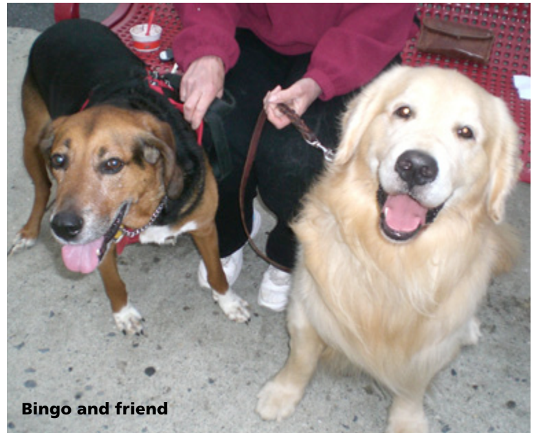
Bingo and friend

When a friend with a Golden Retriever asked me to meet them at a dog-friendly ice cream place, I took Bingo. He sniffed the Golden in the parking lot and wagged his tail happily. The Golden reciprocated. But when he stood in line with me, Bingo tucked his tail. My friend ordered her ice cream and got a complimentary ice cream "sundae" (a small scoop of vanilla ice cream with a dog biscuit in