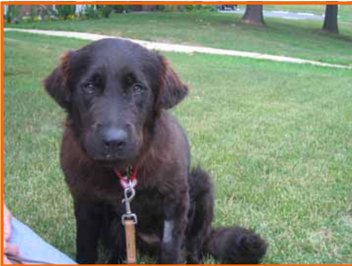
Ivy is ready for her forever home.

Enter the Partnership for Animal Welfare—after this sweet girl was ascertained unowned, PAW took ownership, dubbed her Ivy, and made sure she got the care she needed. After surgery to close the gaping wound in her side, she went to a foster home to recover. Not surprisingly, she appeared to be traumatized by her ordeal and was skittish, but with the love and kindness of PAW volunteers (and some of their own pets), Ivy began to regain her health, her strength, and her trust. Once she was clearly recovered, she was spayed and now awaits a special family who will give her what all PAW animals need and deserve—a forever home where she will be safe and loved.